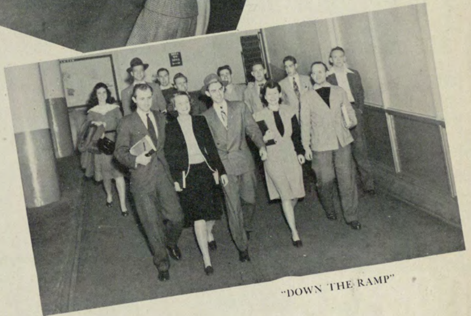
"DOWN 'THE RAMP'"