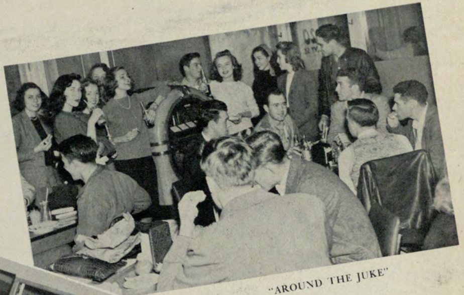
"AROUND 'THE JUKE'"