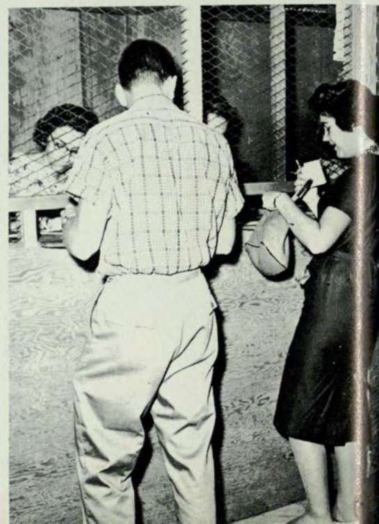
You're now officially a freshman.