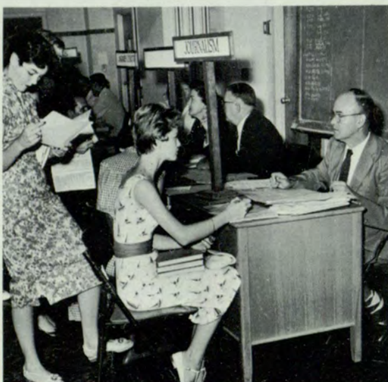
Advisement is only one of the many steps.