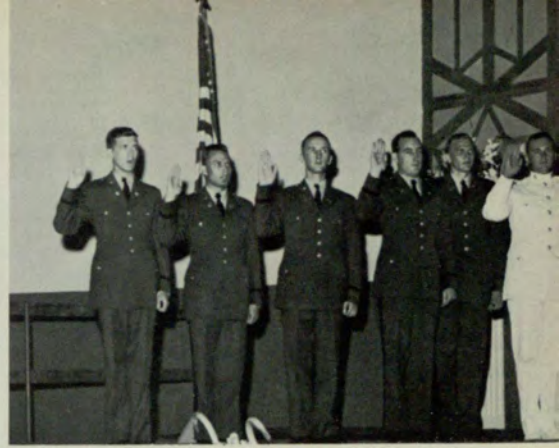
Seniors receiving their 2nd Lt. commissions.