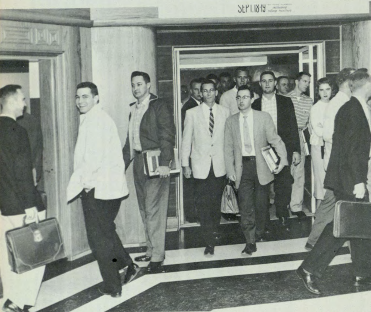
Vim, Vigor, and Vitality . . . at the first.

You wonder which professor requires a term paper. Then after it is all over you still wonder —who will my classmates be?