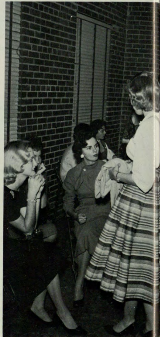
Delta Zeta's talk at tea.