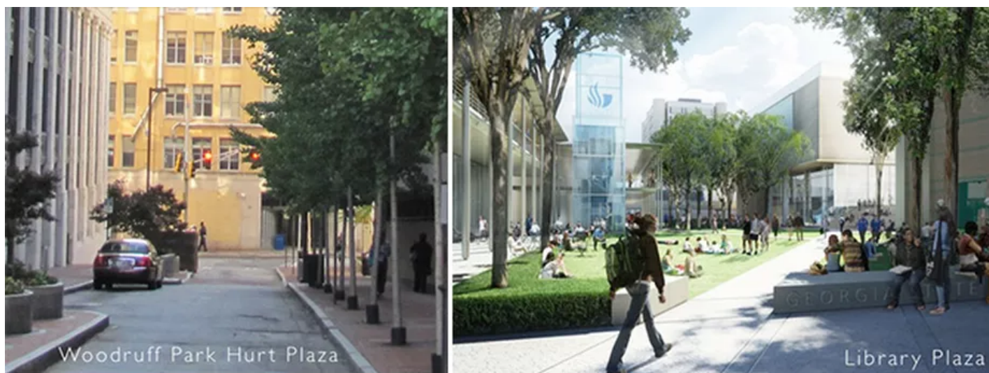
A view of the current termination of Hurt Plaza at Kell Hall, and the vision for the future.

The plan is not new, having first appeared in 2013 as part of the " State of the University " address. However, the announcement is not without controversy.